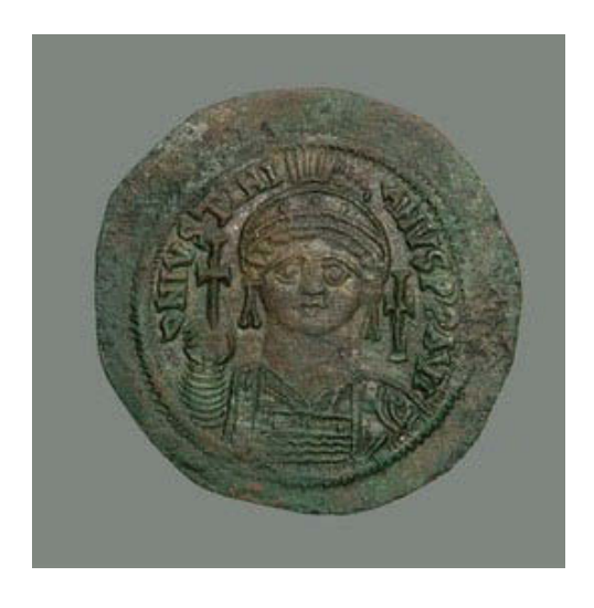
Mansfield Coin Acquisition

<u>Click here</u> to learn more about the most recent DOP edition.