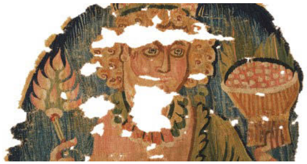
Fragmentary roundel, Egypt, Late Roman Period, fourth-century. Wool; tapestry woven. The Textile Museum 71.10.

On view at the Textile Museum: August 31, 2019 - January 5, 2020