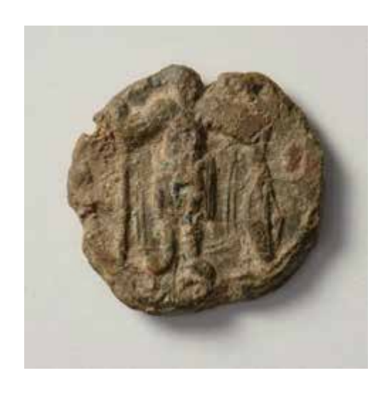
Dumbarton Oaks Papers, vol. 72

<u>Click here</u> to learn more about the most recent DOP edition.