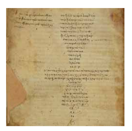
John Chrysostom Manuscript Acquisition

<u>Explore</u> our collection of digital facsimiles and high resolution images.